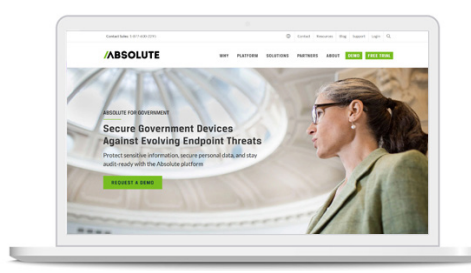
Learn more about Absolute for Government: absolute.com/government